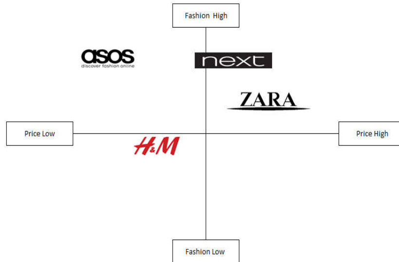
Figure 2: Planned Perceptual Map of NEXT Plc